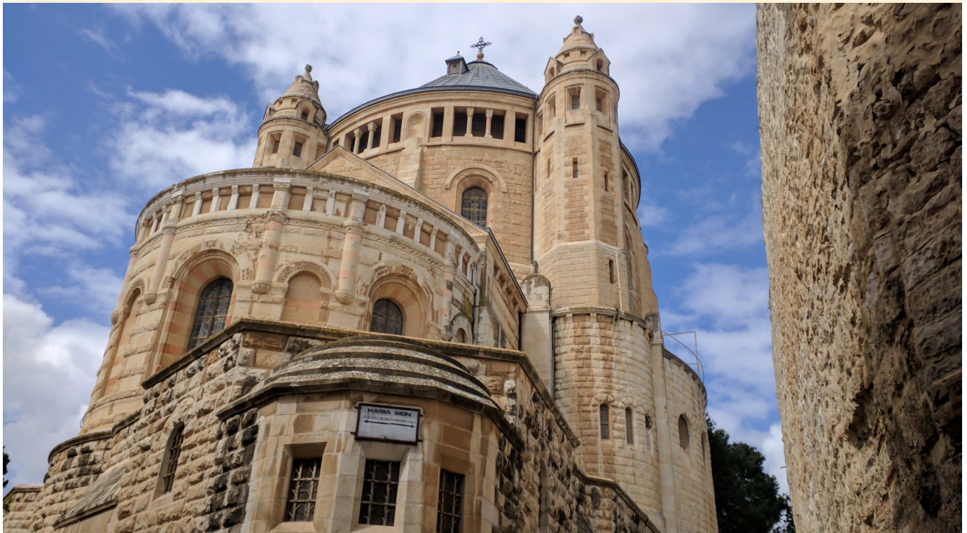
THE ABBEY of the DORMITION in Jerusalem